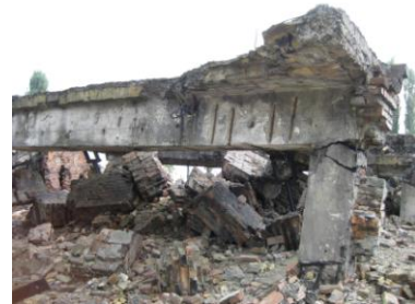
Crematorium destroyed by Germans