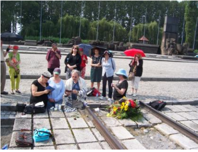
Kaddish at Birkenau