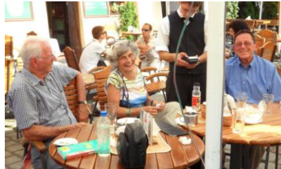
Beginning to say goodbye to old friends and new friends