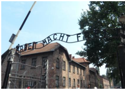
Entrance to Auschwitz-Birkenau