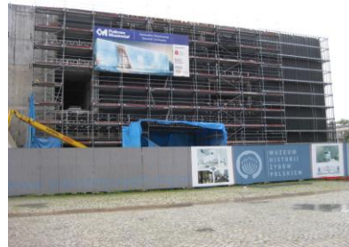
New History of Jews in Poland Museum