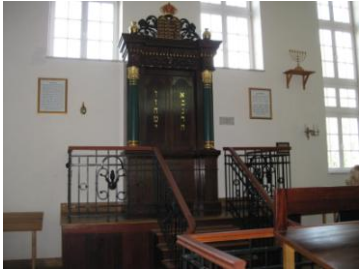
Lublin Yeshiva, now Museum