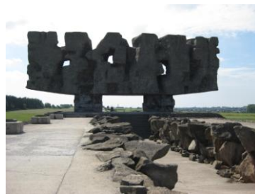
Majdanek, near Lublin