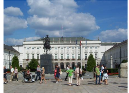
Warsaw, rebuilt after the war