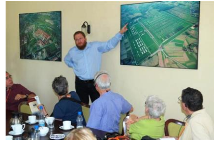
He described Auschwitz as an educational and preservation institution