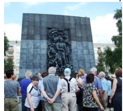
Monday afternoon tour of Jewish Warsaw. This is the Ghetto Memorial