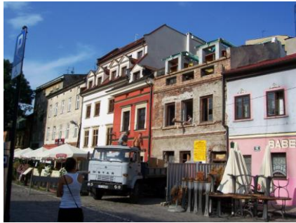
Kazimierz, Jewish neighborhood Of Krakow