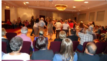
Dancing in evening