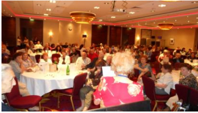
Over 350 in attendance