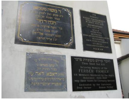
Krakow Synagogue contributors