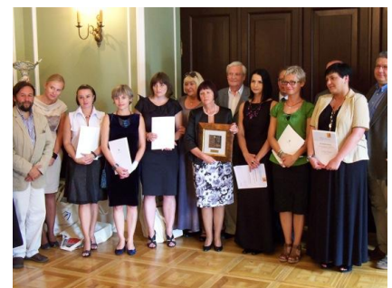
Irena Sendler Teachers Awards winners, sponsored by Polish government