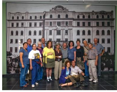
The Old and the New