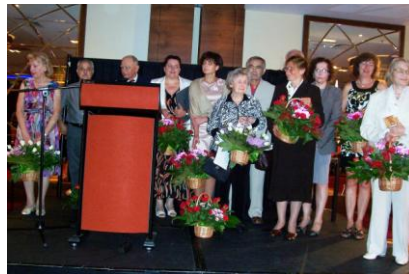
Righteous Poles honored by Yad Vashem and the State of Israel.