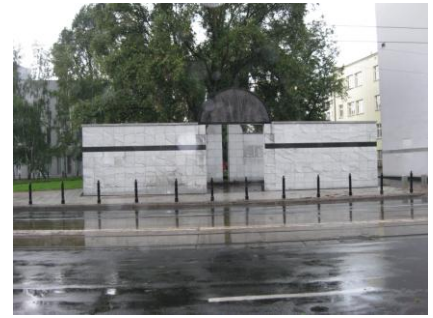
Umschlagplatz, from inside the Ghetto, where Jews were transported to Treblinka