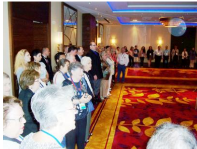
Our traditional closing moments