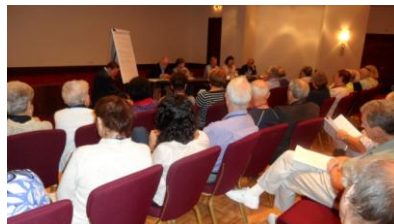
Panel on Anti-Semitism