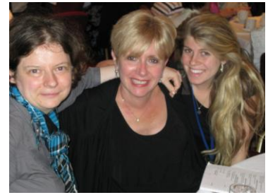
New relationships, new friends