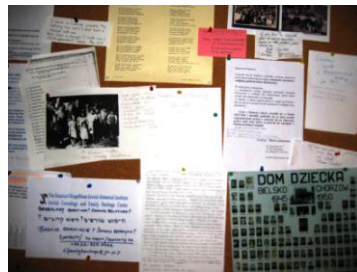
Bulletin Board, after all these years, our searches continue, for loved ones, friends.