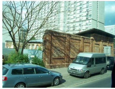
Wall of the Warsaw Ghetto