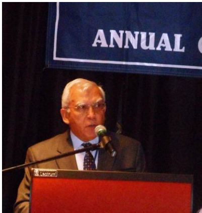
Prof. Adam Rotfeld, spoke on memory, forgiveness, reconciliation