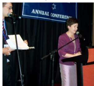
The Mayor of Warsaw Welcomes us