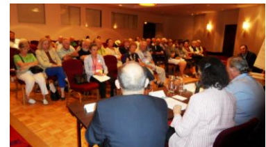
Panel on Anti-Semitism