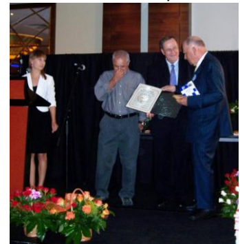
Righteous Poles ceremony hosted by Yad Vashem and Israel Embassy