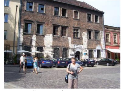
KRAKOW (Cracow), Jewish historical section