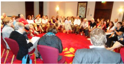
Second Generation panel on Jewish Identity