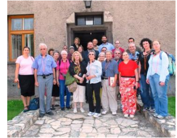
End of Director visit