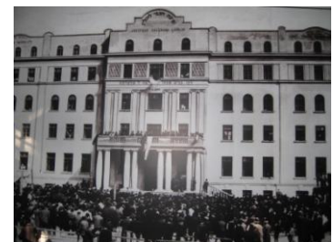
Lublin famous Yeshiva