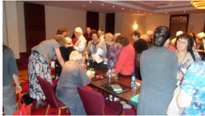
End of panel on "Jewish Children and their Rescuers"