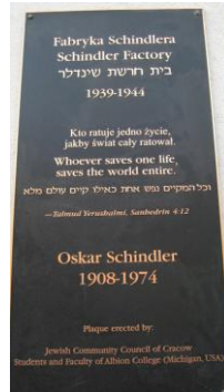
Oscar Schindler factory