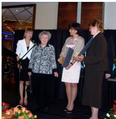
Righteous Poles ceremony